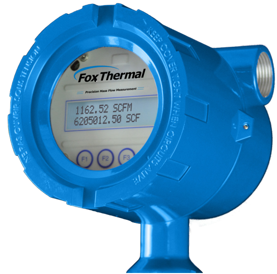
The Model FT4A flowmeter and temperature transmitter is approved for FM/FMc Class I, Division 1, ATEX/IECEX Zone 1. CE Mark. Accuracy compliant with BLM 3175 & API 14.10.

The Reference RTD measures the gas temperature. The instrument electronics heat the mass flow sensor, or heated element, to a constant temperature differential (constant \Delta T ) above the gas temperature and measures the cooling effect of the gas flow. The electrical power required to maintain a constant temperature differential is directly proportional to the gas mass flow rate. The microprocessor linearizes this signal to deliver a linear 4-20mA signal.